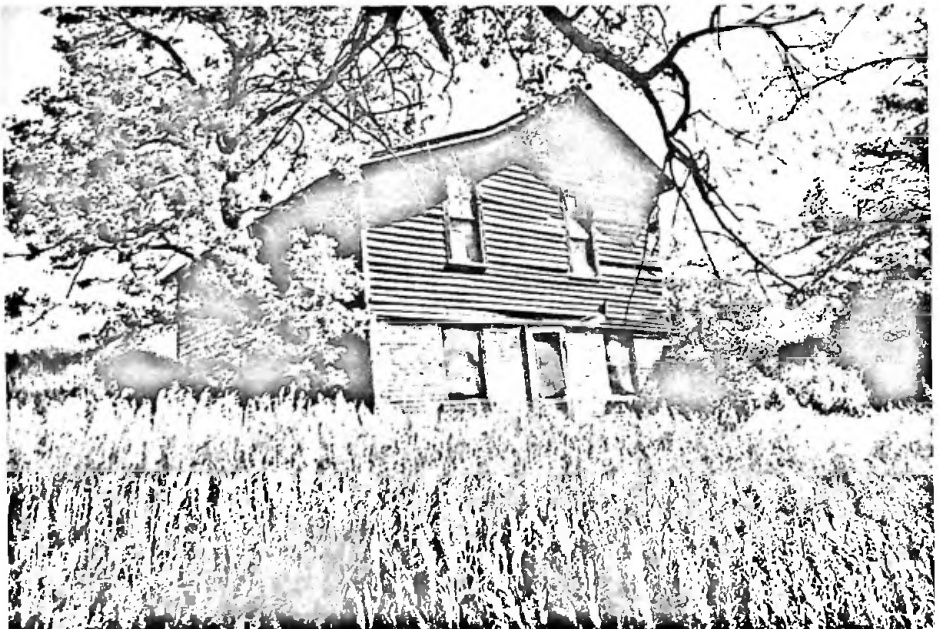
Side view of Higgins-Jochem home, 1917, Henrlette Jochem in foreground.

In 1874, Higgins built the house that stands yet today. The unique house was