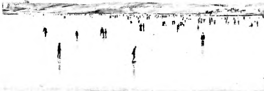
Skaters on the Lake Kearney.

The Union Pacific at that time was the largest patron of the company. They used not hundreds but several thousands of cars of ice, which were shipped to Grand Island