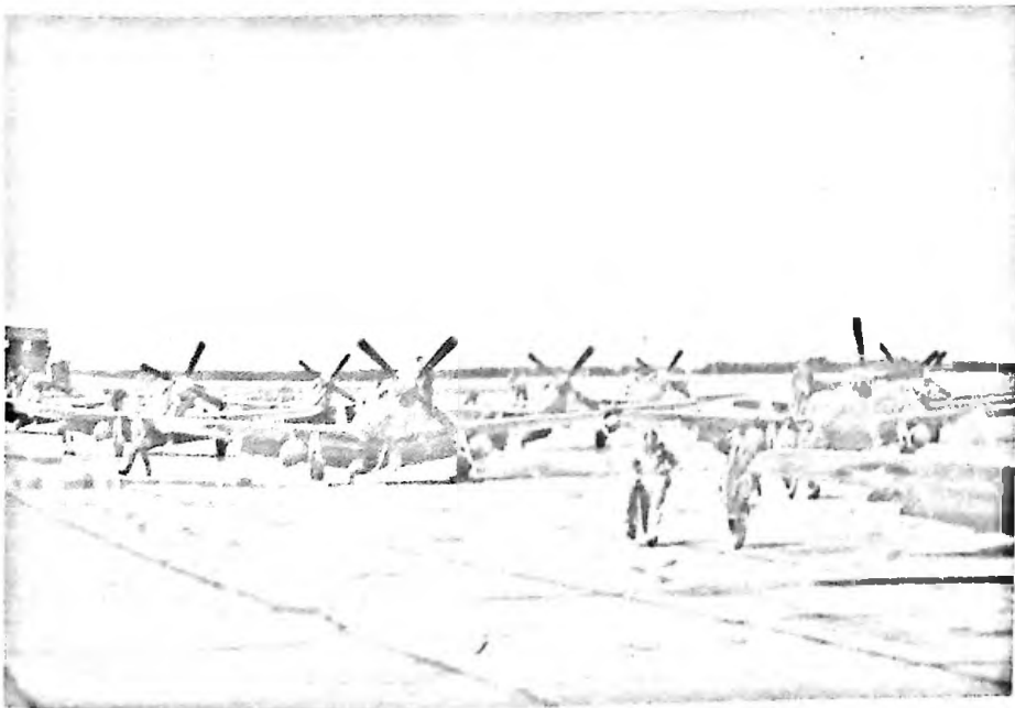
A Squadron of P-51s, 1947

The base was redesignated Kearney Air Force Base in January, 1948. Many improvements were made, but the facilities were considered substandard by some military