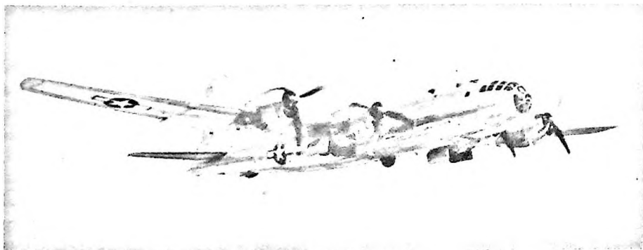
B-29 Superfortress as it cleared the runway for takeoff on first leg of its flight to Theater of Operations — World War II.