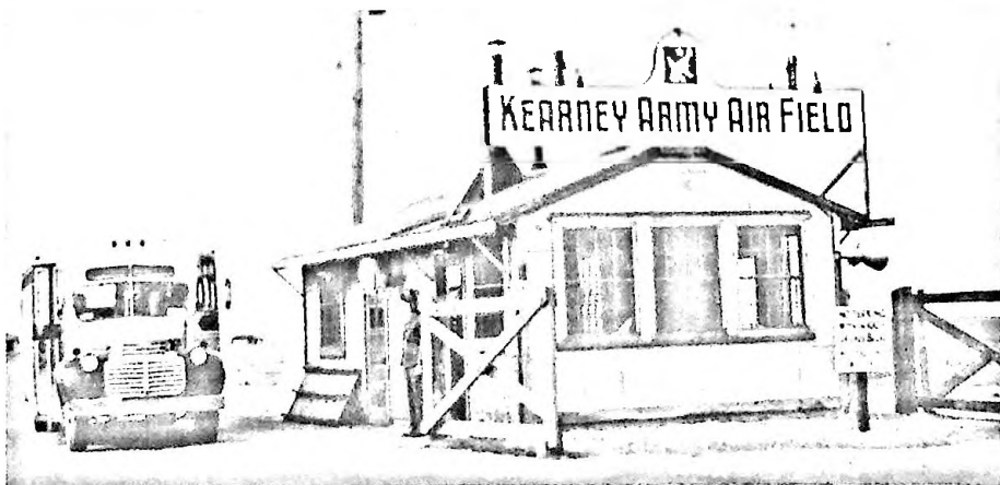
Entrance to Kearney Army Air Field

On September 10, 1942, an area office was established with Captain Lyman G. Youngs assigned as Area Engineer. First view of the project indicated sugar beets, corn and water throughout the area, necessitating the construction of drainage ditches approximately four miles in length to adequately drain the area. Contract for construction of buildings and utilities was awarded to A. Guthrie & Co., Inc., of St. Paul, Minnesota, who moved to the site on September 14 to set up offices and start building construction.