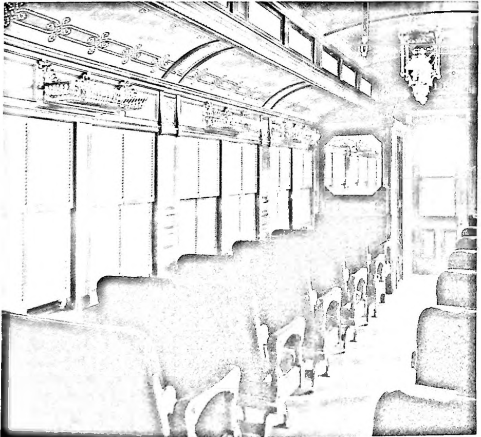
Interior view of Passenger Car used on the Kearney Branch.

By the middle of June of 1890, construction on the new railroad was moving ahead at a rapid pace. Bridge timbers, ties and rails for the road were arriving in Kearney at the rate of over twenty carloads a day. Nearly ten miles of ties had been laid and piles had been driven for nine bridges, one being twelve miles northwest of Kearney. The road as laid out left Kearney headed east, and then made a large curve around the east end of the high ground separating the Platte and Wood River valleys, thus avoiding