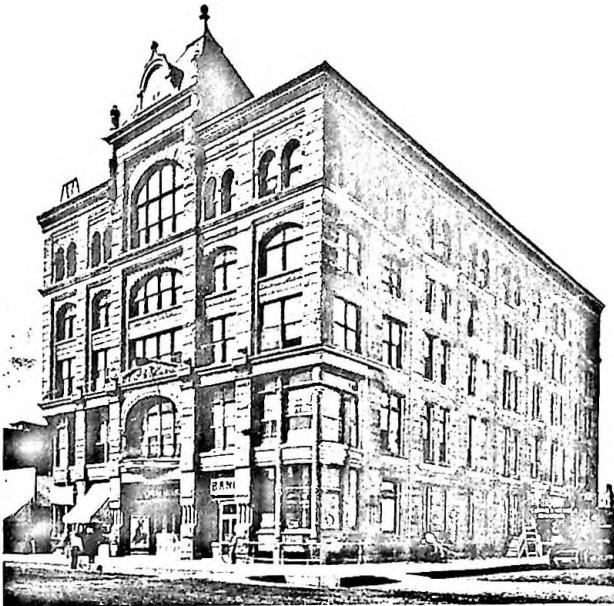
Kearney Opera House, 1891-1954

To be concise, the play was a failure, and from natural causes. Too many of the characters were attempted by persons totally unfit to appear on the stage . . . wax ones would be better.