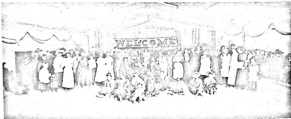
Kearney Roller Skating Rink, 1910.

The remodeled rink was not suited for play productions, or even for musical concerts. The acoustics were such that a program at one end of the building could not be heard at the other end, so performances were given near the center of the building. After the opening of the "new" opera house in 1891, the Model apparently reverted to its original purpose and became the Kearney Skating Rink.