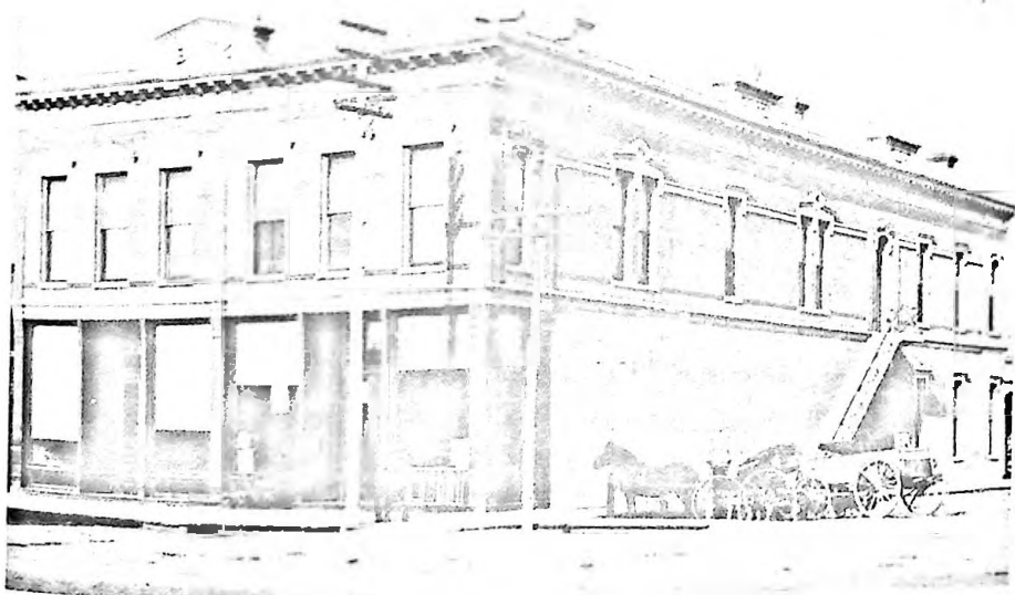
Switz Building, 1889, 2301-03 Central Avenue.